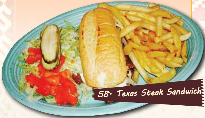
58. Texas Steak Sandwich

Grilled chicken sandwich with cooked onions, tomatoes, lettuce and cheese on a torta bun. Served with fries – 13.95