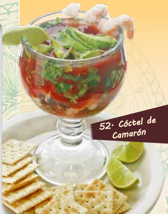
52. Cóctel de Camarón