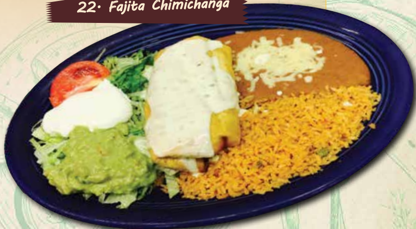
22. Fajita Chimichanga