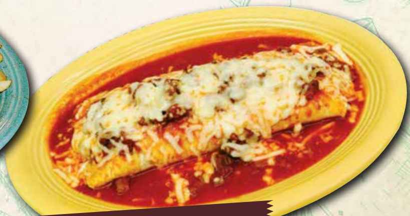
Sp7. Hot & Spicy Burrito

All take-out orders, 25¢ extra per item.