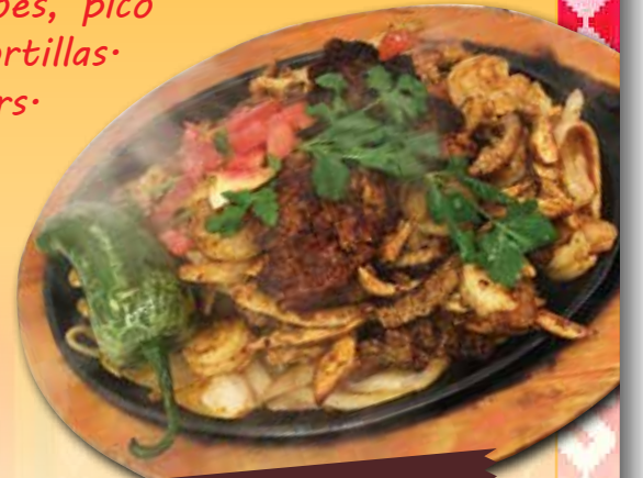
26. Parrillada Mexicana