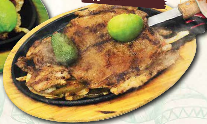
40. Carne Asada