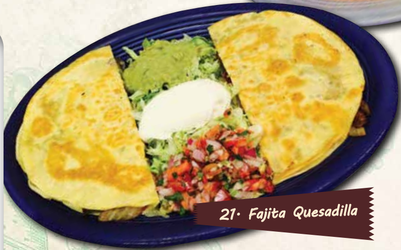
21. Fajita Quesadilla

Notice: Consuming raw or undercooked meats, poultry, seafood, shellfish, or eggs may increase the risk of food-borne illness, especially if you have certain medical conditions.