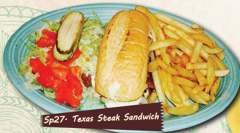
Sp27. Texas Steak Sandwich

Grilled chicken sandwich with cooked onions, tomatoes, lettuce and cheese on a torta bun. Served with fries – 11.95