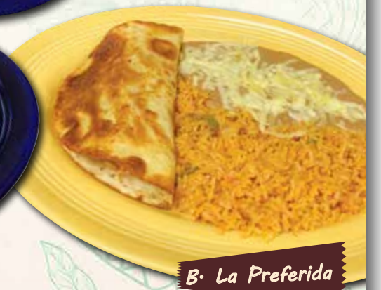
B. La Preferida