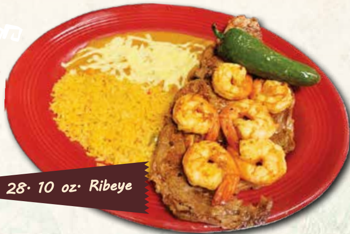
28. 10 oz. Ribeye

Grilled onions, bell peppers, tomatoes and mushrooms – 19.95