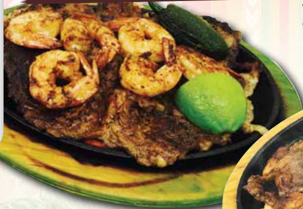
40. Carne Asada with Shrimp