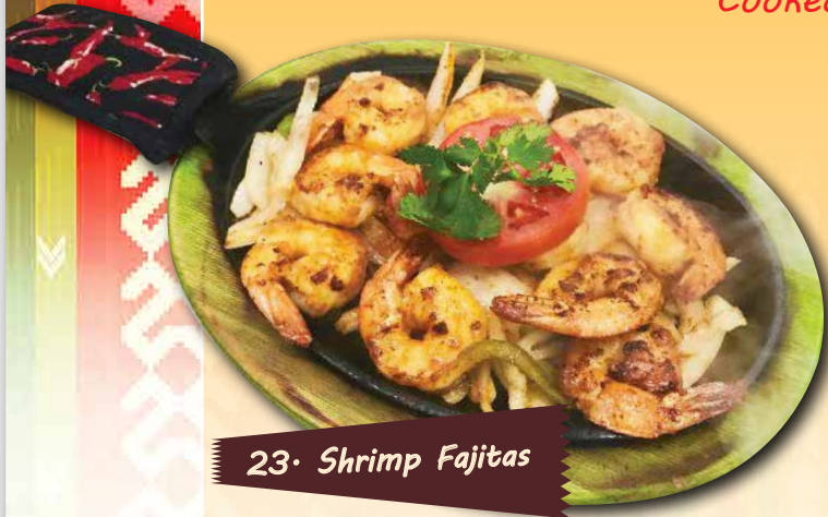
23. Shrimp Fajitas

Served with rice, beans, lettuce, tomatoes, pico de gallo, sour cream, guacamole and tortillas. Cooked with onions and bell peppers.